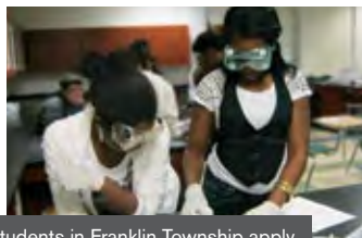
Students in Franklin Township apply BTE program in the classroom.