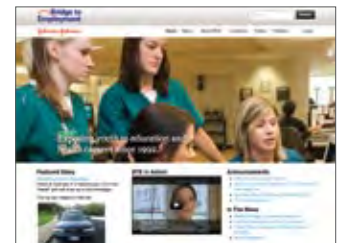
New BTE website and Facebook page promote cross-site exchange and learning.

FHI 360 acquires the programs, expertise, and assets of AED; the NIWL continues to manage the BTE program. NIWL releases three curricula — an orientation session and two enrichment sessions for training BTE volunteers.